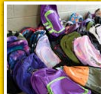
Students attending the Stuff-A-Bus program could select from hundreds of backpacks, each stuffed with essential school supplies.

Academics at its best • Pursuit of excellence • Where students come first.